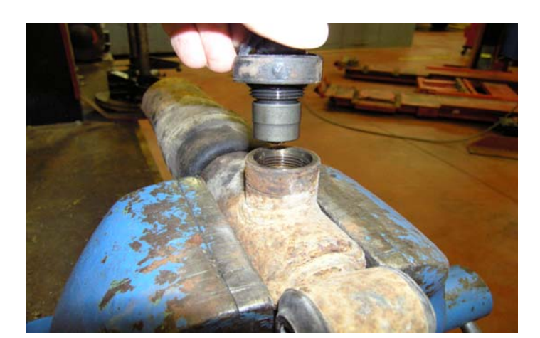
FIG 7, Rear Shock Solenoid Removed