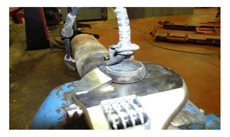
FIG 7, Rear Shock Solenoid Removed