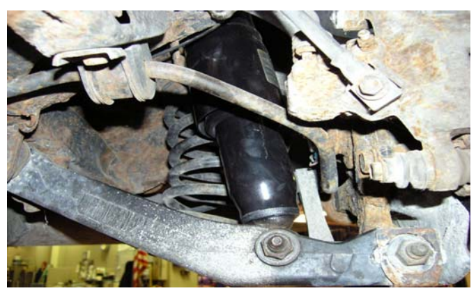
FIG 10, Rear Shock Installed Upper Portion Right Side