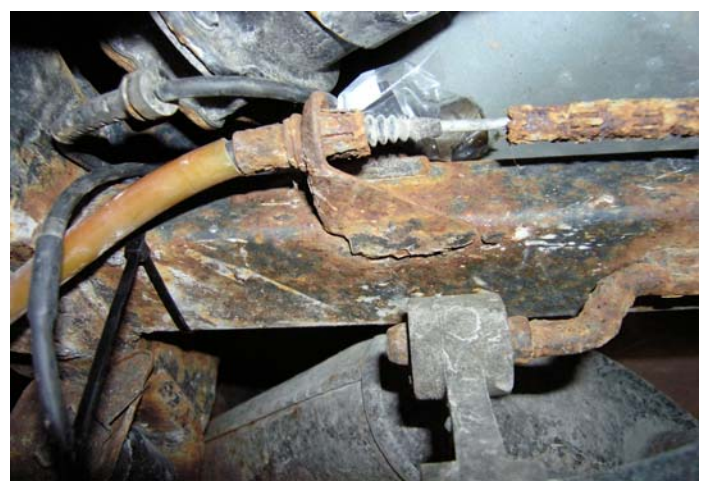
FIG 9, Rear Shock Installed Lower Portion Left